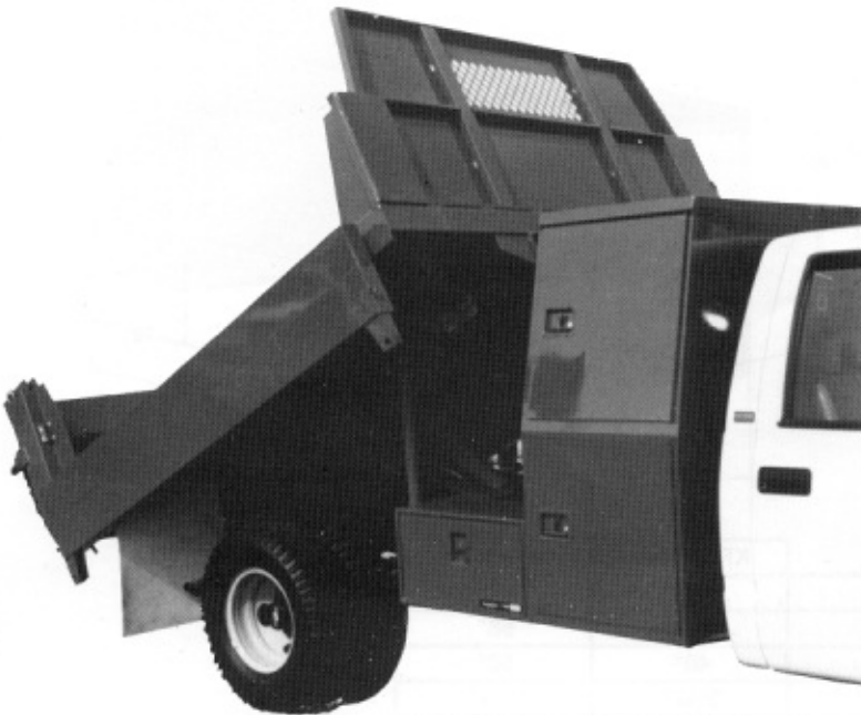
(Model KP-82C-L shown with 14.25" x 24.12" under body toolbox mounted on each side)